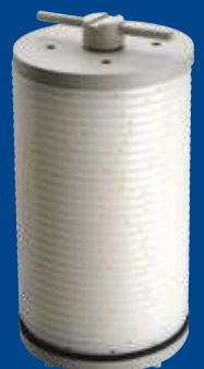
Disc filter assembly