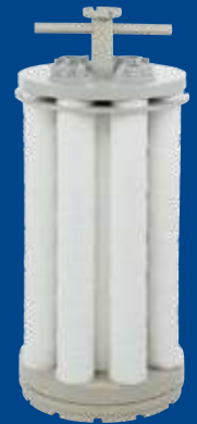
Cartridge filter assembly