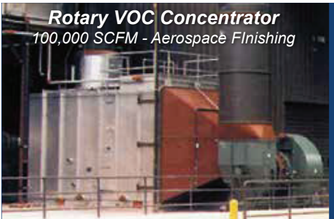
Rotary VOC Concentrator 100,000 SCFM - Aerospace Finishing