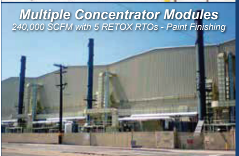
Multiple Concentrator Modules 240,000 SCFM with 5 RETOX RTOs - Paint Finishing