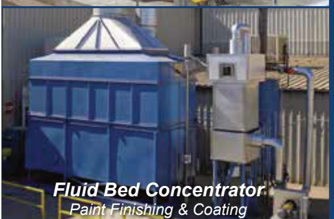
Fluid Bed Concentrator Paint Finishing & Coating