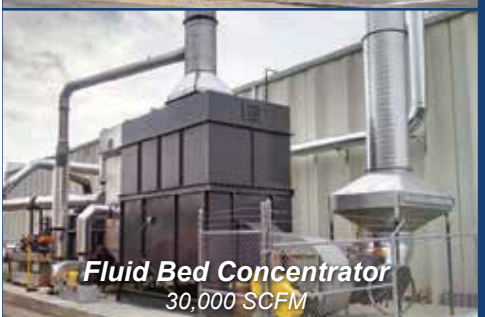
Fluid Bed Concentrator 30,000 SCFM