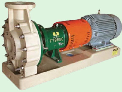
SERIES 1500 HORIZONTAL ANSI PUMP