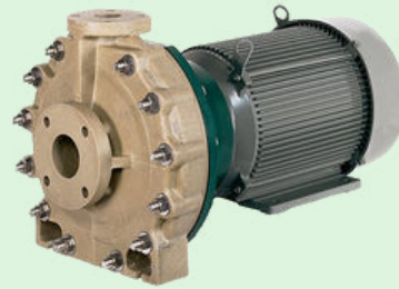
SERIES 1530 HORIZONTAL CLOSE COUPLED PUMPS