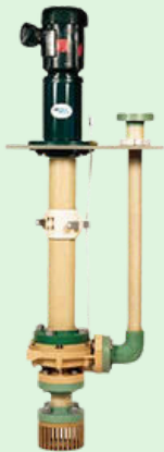
SERIES 5500 VERTICAL SUMP PUMP